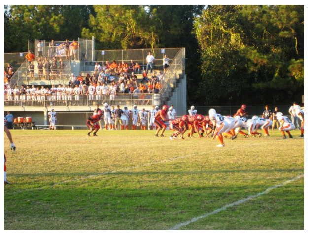
Christian schools & Christian homeschool teams will compete in the 2011 National High School Football Tournament

Wednesday, Nov 9th, 2011 thru Saturday, Nov 12th, 2011