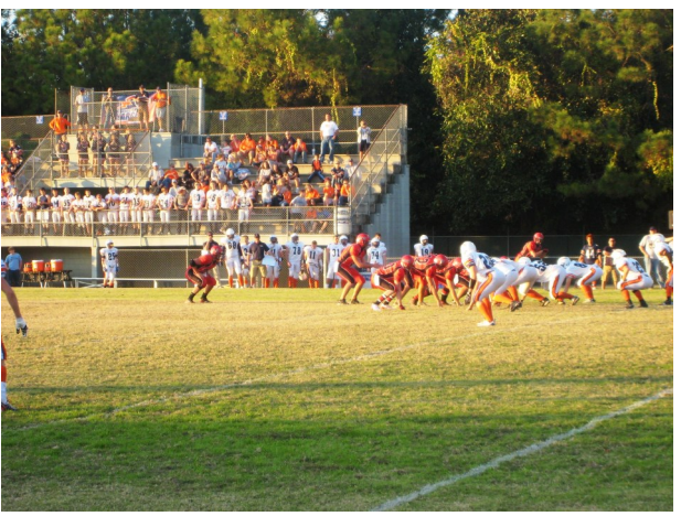
Christian schools & Christian homeschool teams will compete in the 2016 National High School Football Tournament

Friday, Nov 11th, 2016 thru Monday, Nov 14th, 2016