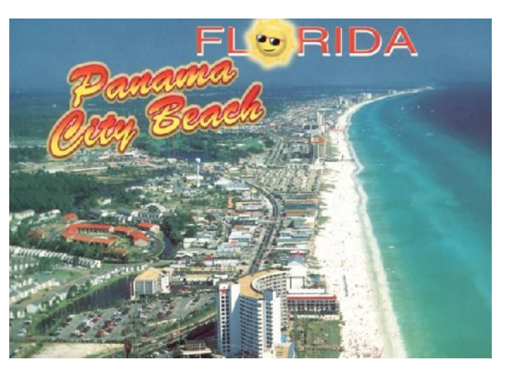
Panama City Beach, Florida

Costs includes room for 4 nights and breakfast on Saturday, Sunday and Monday. There is Awards Ceremony on Monday after Championship game.