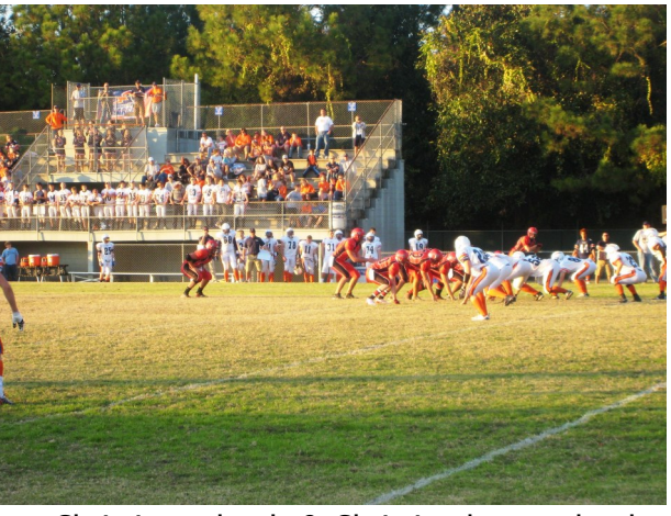
Christian schools & Christian homeschool teams will compete in the 2017 National High School Football Tournament

Friday, Nov 10th, 2017 thru Monday, Nov 13th, 2017